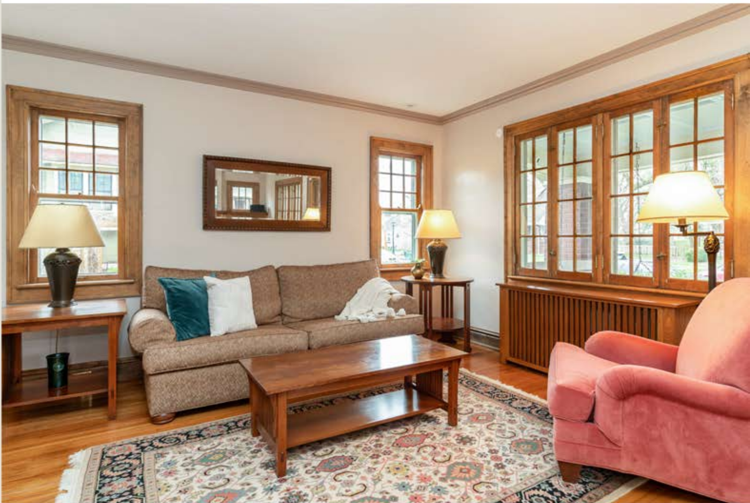
NORTHMOOR PARK - CLINTONVILLE