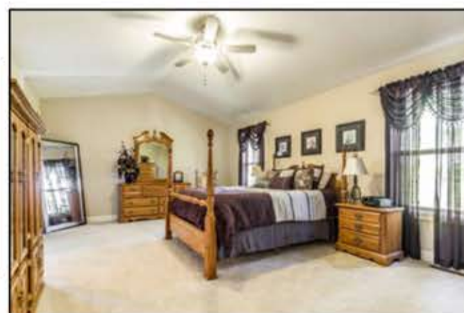
Owner's Bedroom 19'4" x 13'8" Carpet, white wood trim, painted walls, cathedral ceiling, two windows, ceiling fan with lighting, walk-in closet done by Closets by Design.