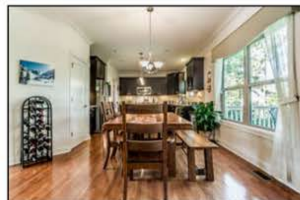
Eating Area 11'1" x 16'3" Hardwood floor, white wood trim & crown molding, painted walls, double window, chandelier, glass door to deck.