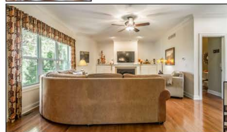
Living Room 15'5" x 23'9" Hardwood floor, white wood trim & crown molding, painted walls, triple window, ceiling fan with lighting, recessed lighting, gas log fireplace with ceramic tile hearth & surround, white wood mantel, white cabinetry.