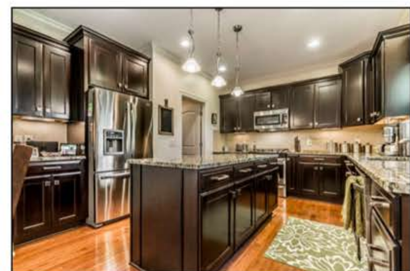
Kitchen 11'1" x 14'2" Hardwood floor, white wood trim & crown molding, painted walls, ceramic tiled backsplash, window, pendant lighting, recessed lighting, under cabinet lighting, natural cabinetry, granite countertops, island, stainless steel double sink with disposal. Appliances include: stainless steel Kenmore refrigerator, stainless steel Kenmore dishwasher, stainless steel Kenmore microwave, stainless steel Kenmore oven, black Kenmore gas range.