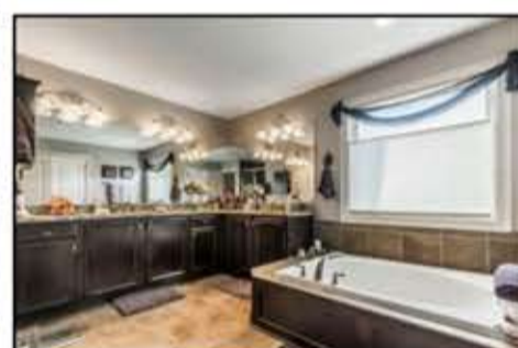
Owner's Bath Double white wood doors, ceramic tile floor, white wood trim, painted walls, window with shades, ceiling light fixture, wall light fixtures, water closet, natural cabinetry, granite countertops, two porcelain sinks, corner garden soak tub with tile surround, wall mirrors, medicine cabinet, walk-in shower.