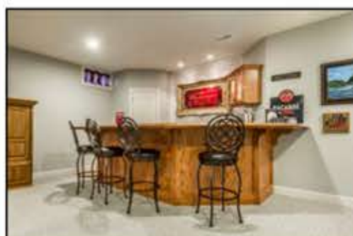
Recreation Room 17'5" x 31'6" Berber carpet, white wood trim, painted walls, window, double window, recessed lighting, decorative ceiling light fixture, two utility closets, bar with natural cabinetry, granite countertops, sink, glass display cabinets, access to unfinished storage area and crawl space.