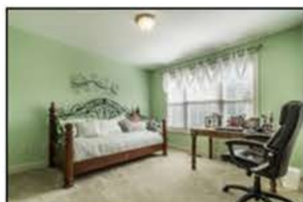
Bedroom 9'3" x 10'1" Carpet, white wood trim, painted walls, triple window with blinds, ceiling light fixture, double closet.