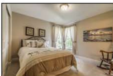
Bedroom #2 12' x 11'6" Carpet, white wood trim, painted walls, two windows, ceiling light fixture, double closet.