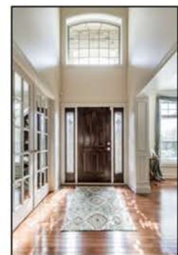
Foyer Natural wood entry door with two leaded glass sidelights, hardwood floor, white wood trim & crown molding, painted walls, second floor window, chandelier, coat closet.